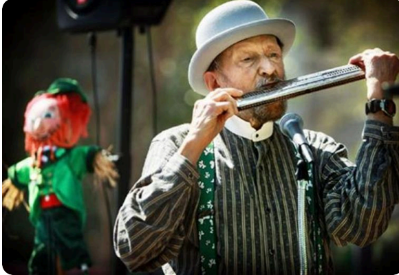
St Patrick's Day